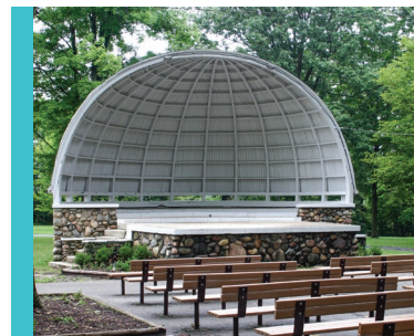
Matter Park Band Shell

The City of Marion operates many parks. Community buildings, pavilions, recreational facilities and a band shell are available for rent.