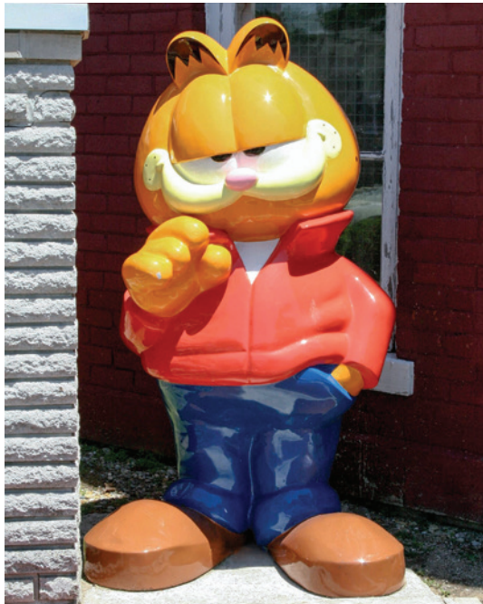
Cool Cat, Fairmount

Dial 765-997-7034 and follow the prompts.